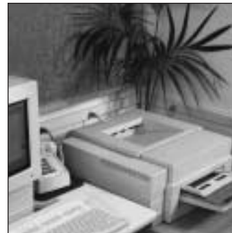
Plugmold Systems shown in typical applications.