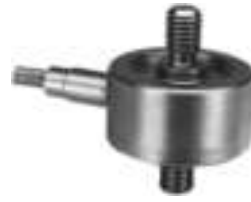
Model 31 (Tension/Compression)