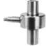
Model 34 (Tension/Compression)

Models 31 and 34, Precision Miniature load cells measure both tension and compression load forces of 50 grams to 10,000 lb. These models are our highest accuracy, rugged miniature load cells. Model 31's welded, stainless steel construction is designed to eliminate or reduce to a minimum, the effects of off-axis loads. (The internal construction assures excellent long term stability for ranges 1000 grams and above.) A modification permits this model to be completely welded for underwater applications. The Model 31 tension/compression load cell has male threads while the Model 34 tension/compression load cell has female threaded load attachments. High accuracies of 0.15-0.25% full scale are achieved. Each bonded strain gage unit is built of welded 17-4 PH stainless steel for additional ruggedness. All load cells that have ranges 10 lb. have a small electrical zero balance circuit board which is in the lead wire (approximately 1"x .087" thick). This balance board does not have to be the same temperature as the transducer. Applications include cable tension and electromechanical parts testing.