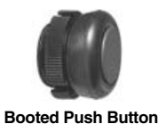
Booted Push Button