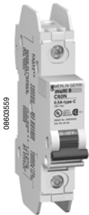
Table 9: Specifications for UL 489 C60 DC Circuit Breakers