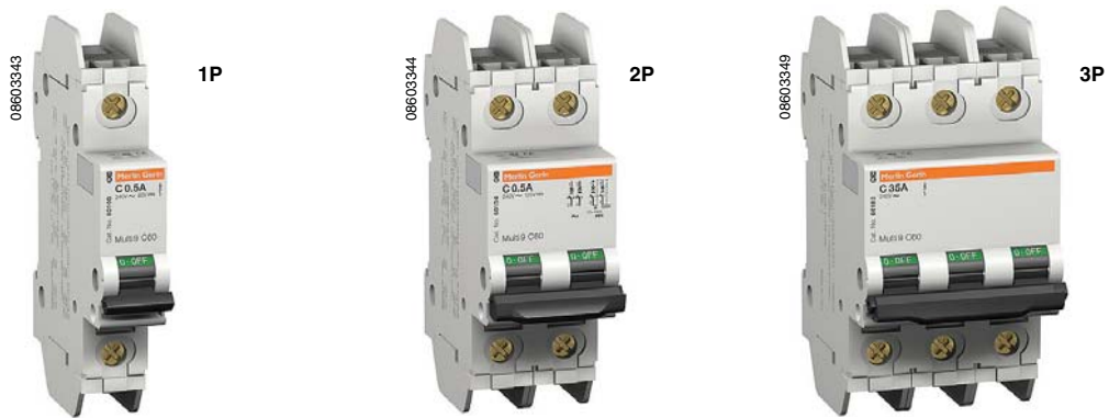
Figure 2: UL 489 Listed Multi 9 C60 Circuit Breakers

Better Protection —Multi 9 supplementary protectors and miniature circuit breakers limit let-through current, providing faster separation of the component from the fault, thereby reducing system damage.