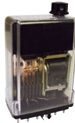
Industrial Pin Out