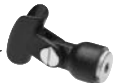
Tripod Mount Microphone Holder Model No. 00184