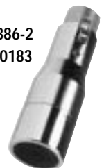
Extra Microphone For 886-2 Model No. 00183

Sound pressure level calibrators are used before or after taking measurements with sound level meters and noise dosimeters. The 890-2 can adjust Simpson models 886-2 and 884-2 or other sound level meters with a 1" diameter Microphone. The 890-2 provides a constant 94 dB or 114 dB sound pressure level at 1 KHz (0 dB = 0.0002 Mbar). Calibrator is immune to a wide range of temperature and humidity conditions while maintaining tight output level tolerances.