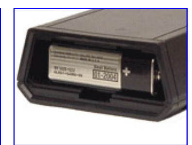
9V Battery Compartment