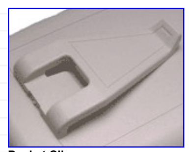
Pocket Clip RETURN TO TOP