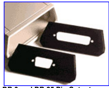
DB 9 and DB 25 Pin Cutouts