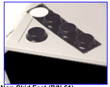
Non-Skid Feet (P/N 51)

Home | About SERPAC | Products | Accessories | Customizations | Distributors | Buy Now! | Contact Us PRODUCTS: A-Series | C-Series | CA-Series | CH-Series | G-Series | H-Series | M-Series | R-Series | S-Series | SL-Series © 2004, SERPAC Electronic Enclosures. All Rights Reserved