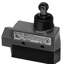
Side mount with seal boot

E6 (side mount) and V6 (flange mount) switches are offered with or without actuator seal boots. Both have a combination insulator/seal cemented inside the bottom enclosure. Lead washers are used to seal the