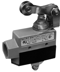
Side mount without seal boot