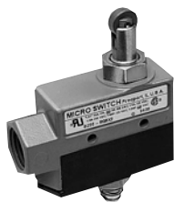
Side mount without seal boot