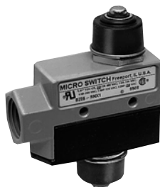
Side mount with seal boot