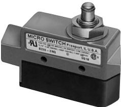
Side mount without seal boot