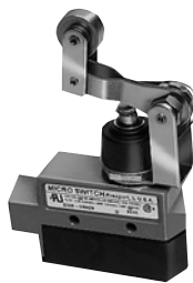
Side mount with seal boot