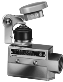
Side mount with seal boot