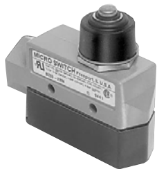
Side mount with seal boot