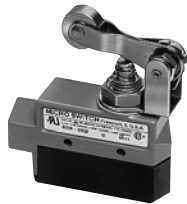
Side mount without seal boot