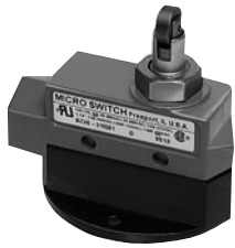
Flange mount without seal boot