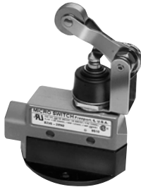
Flange mount with seal boot