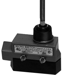
Side mount with seal boot