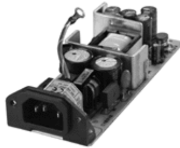
PSA-25LS OEM OPEN FRAME