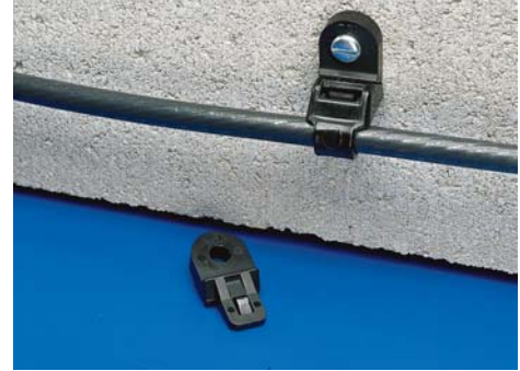
T250 heavy duty cable tie and lashing tie mount application

These cable ties offer a high minimum tensile strength and have a buckle feature which allows the end of the cable tie to be tucked away if necessary. The buckle also snaps into HellermannTyton LTM, lashing tie mounts.