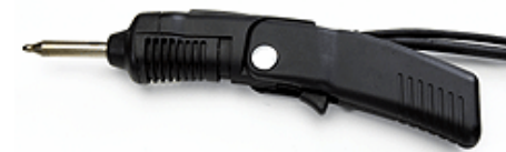
Versatile Pencil and Pistol Grip Hand-piece System