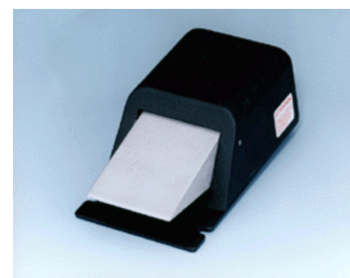
Classic II Footswitch