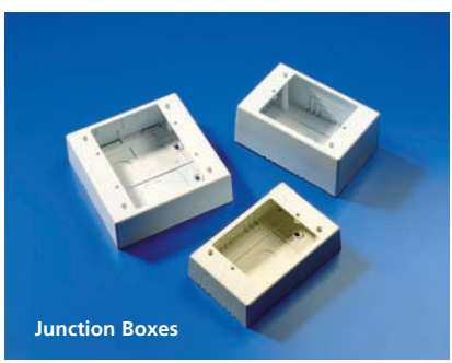
*Recommend using the TSRX-JB2 for voice and data applications