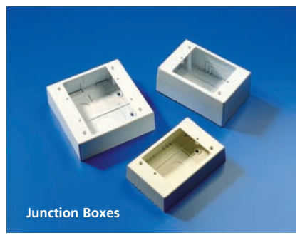
*Recommend using the TSRX-JB2 for voice and data applications

Replace "X" in the part number with the following letters for desired color: X = I (ivory), FW (office white), W (white)