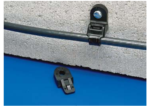
T250 heavy duty cable tie and lashing tie mount application

These cable ties offer a high minimum tensile strength and have a buckle feature which allows the end of the cable tie to be tucked away if necessary. The buckle also snaps into HellermannTyton LTM, lashing tie mounts.