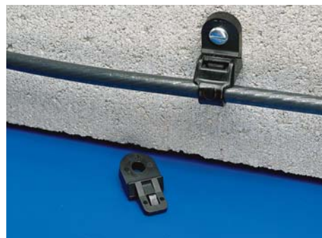
T250 heavy duty cable tie and lashing tie mount application

These cable ties offer a high minimum tensile strength and have a buckle feature which allows the end of the cable tie to be tucked away if necessary. The buckle also snaps into HellermannTyton LTM, lashing tie mounts.