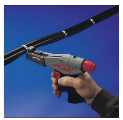
HellermannTyton's MK9SST tool is durable and lightweight, offering superior stainless steel cable tie installation.