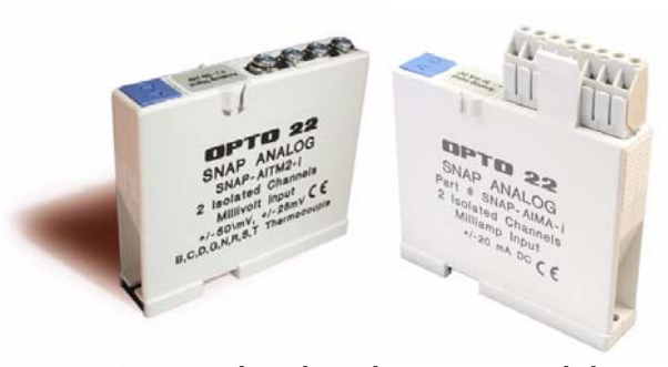
SNAP Isolated Analog Input Modules

Transformer isolation prevents ground loop currents from flowing between field devices and causing noise that produces erroneous readings. Ground loop currents are caused when two grounded field devices share a connection, and the ground potential at each device is different. Optical isolation provides 4,000 volts of transient