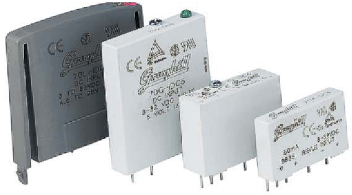
70L-IDC 70G-IDC 70-IDC 70M-IDC