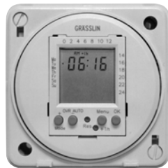
FM1D20E (flush mounting)