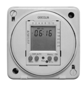
FM1D20E (flush mounting)