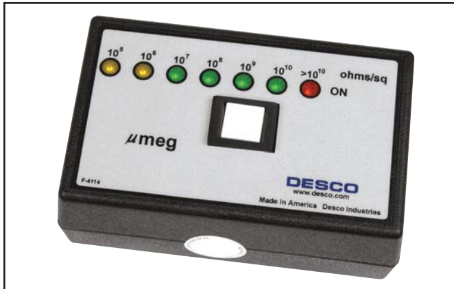
Figure 1. 19635 Micro Meg Pocket Megohmmeter