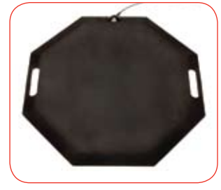
3M™ Anti-Fatigue Mat 9920