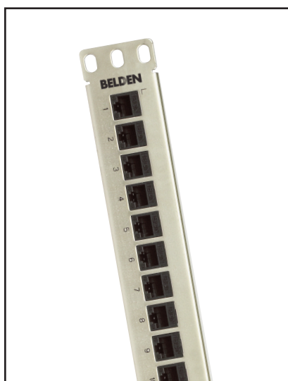
10GX KeyConnect Patch Panel