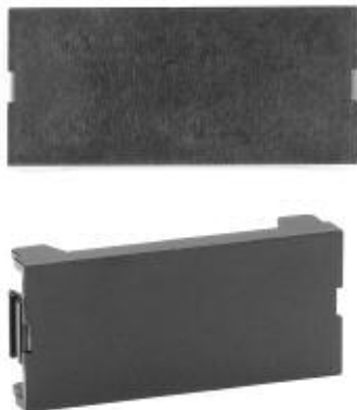
AX101764 2-Unit MediaFlex Filler Insert

MediaFlex Filler Inserts are one part of the comprehensive line of plates and inserts that snap together to create a full line of modular workstation outlets. This product line, called the MediaFlex Modular Outlet Series, has been designed with the help of industrial designers as well as other professionals in the industry in order to combine flexibility, ease of use and high-tech aesthetics for work area installations.