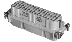
Abbildung stellvertretend für alle verfügbaren Polzahlen.