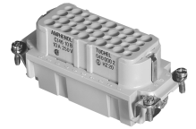
Abbildung stellvertretend für alle verfügbaren Polzahlen.