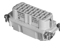
Abbildung stellvertretend für alle verfügbaren Polzahlen.