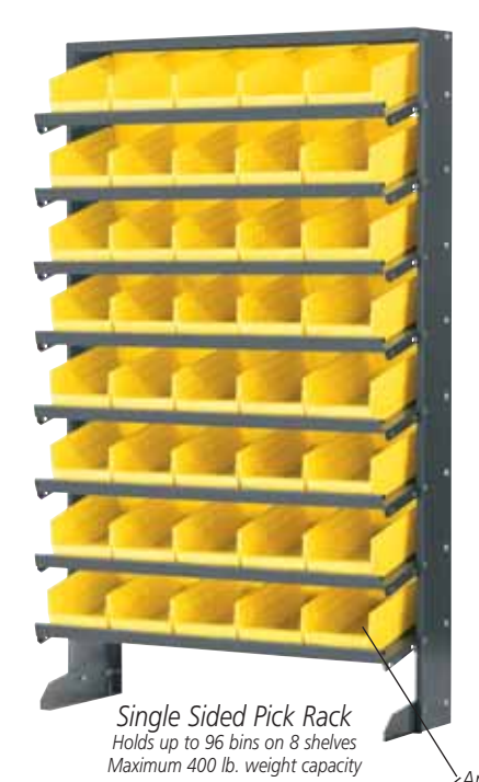
Angled shelves increase picking efficiency