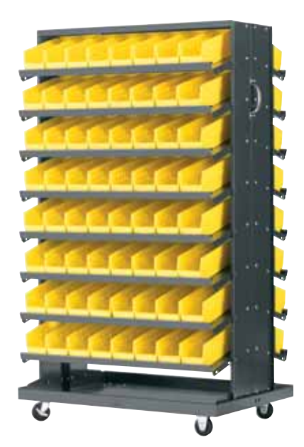
Double Sided Pick Rack & Mobile Kit

Creates a mobile double sided pick rack Maximum 500 lb. weight capacity