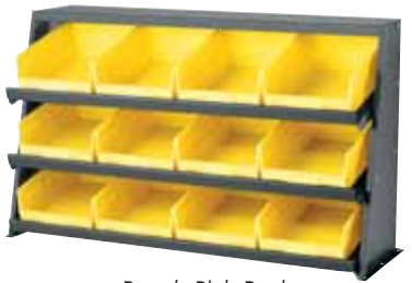
Bench Pick Rack Holds up to 24 bins on 3 shelves