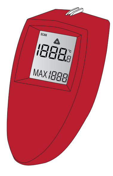
LCD Display for IR-750

The ability of the IR-999 thermometer to read sub-zero temperatures adds to it's versatility. The IR-999 measures up to 999°F (535°C)