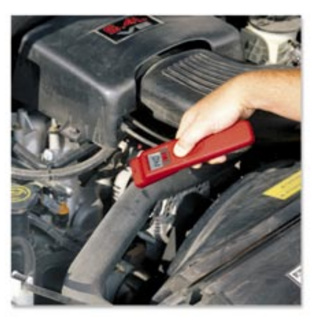
Check cylinder heads, heating and cooling systems, and scan radiators for blockage.

The ability of the IR-999 thermometer to read sub-zero temperatures adds to it's versatility. The IR-999 measures up to 999°F (535°C)