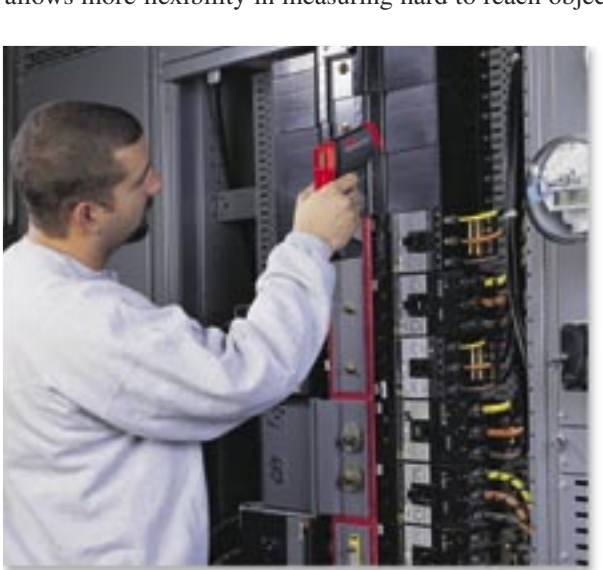
Check for hot spots in electrical panels and circuit breakers, generators and gearboxes.