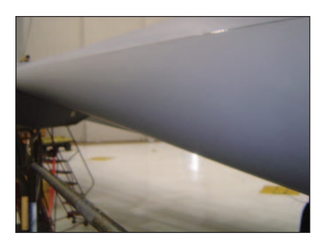
Wing leading edge installation complete with edge seal.