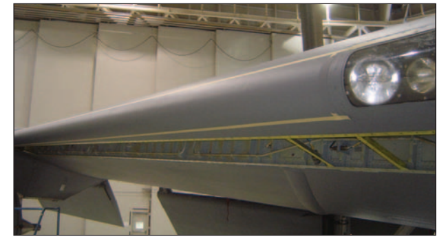
Wing leading edge.

3M tapes are used by OEM and military organizations to minimize corrosion, erosion and FOD.