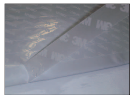
Skip slit liner being removed.